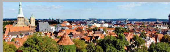
Osnabrück, a city with 800 years of history